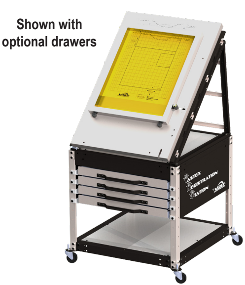
Separate components for screen room and press department